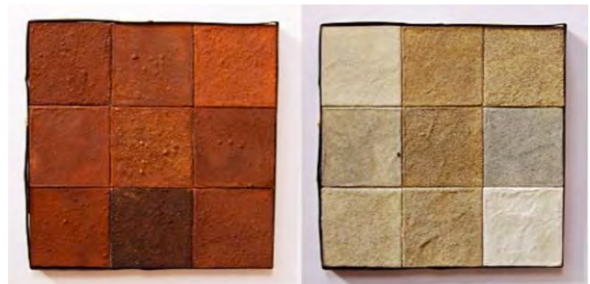
Inspiration Image- 2-D Art (please note use of mixed media)