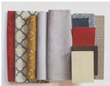
Sample Material Palette