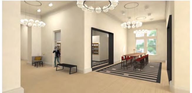
2nd Floor Communal Work Table