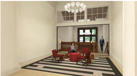
2nd Floor Sitting Area