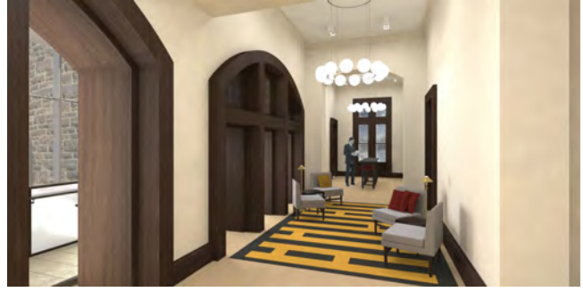
1st Floor Sitting Area